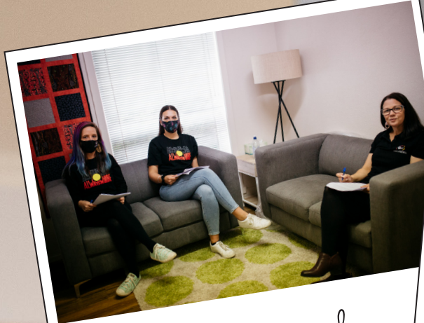
Our team being interviewed by Melbourne Museum