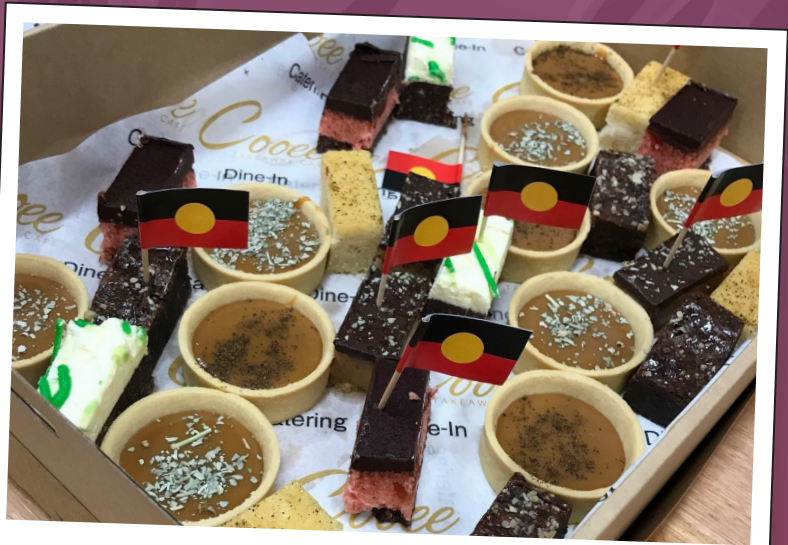
Cooee Cafe catering NAIDOC