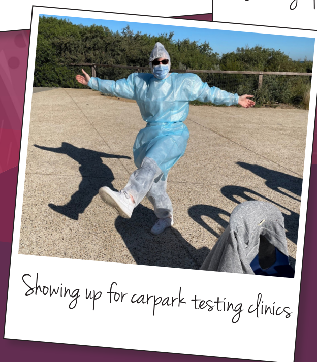
Showing up for carpark testing clinics