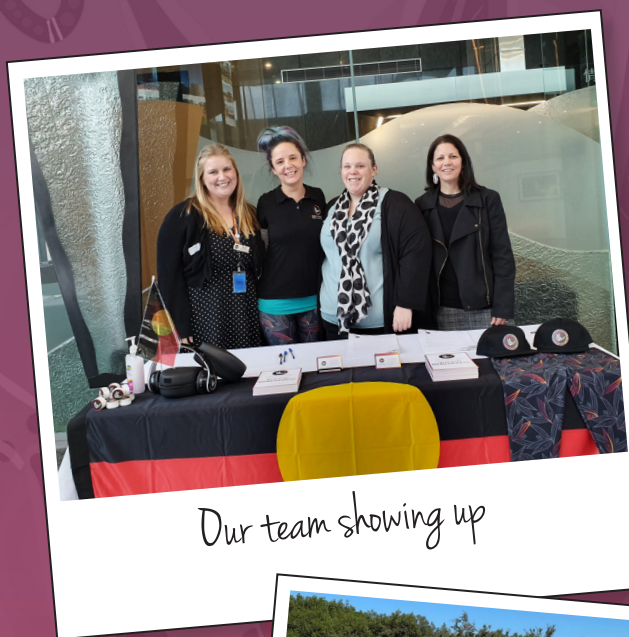
Our team showing up